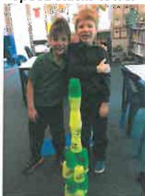
Speed stacks tower